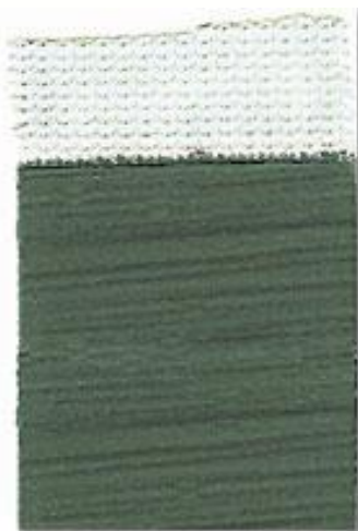
PerfectMembrane with green tint

Bonds concrete, wood, tile, mastic or asphalt surfaces, to epoxies, acrylics, urethanes, or polymer cements.