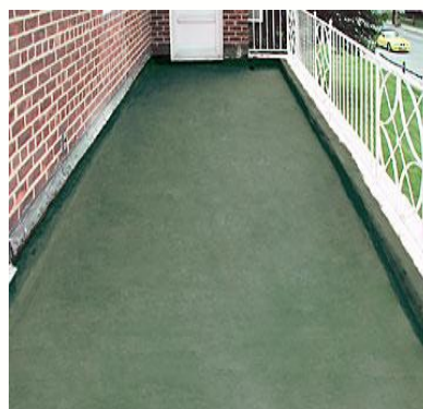
Ready for Coatings